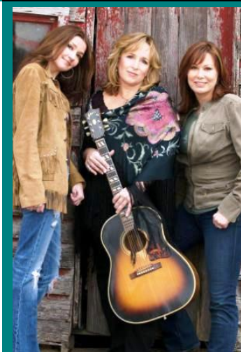
Suzy Bogguss Gretchen Peters. & Matraca Berg

The UK's Maverick magazine called the show "pure magic... by no means a slick, glitzy, polished performance; just three superb singer- songwriters sitting together informally and having a great time."